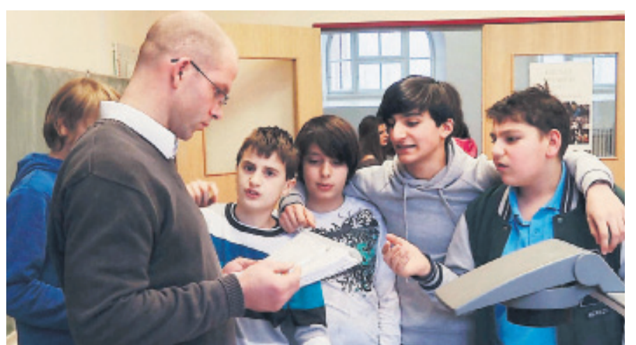
A still from the film "Zwischen den Stühlen."