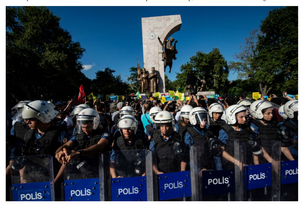
Turkish anti-riot police officers stand guard as demonstrators gather on July 27, 2019, in Istanbul to support refugees and demonstrate against the Turkish government's recent refugee action.