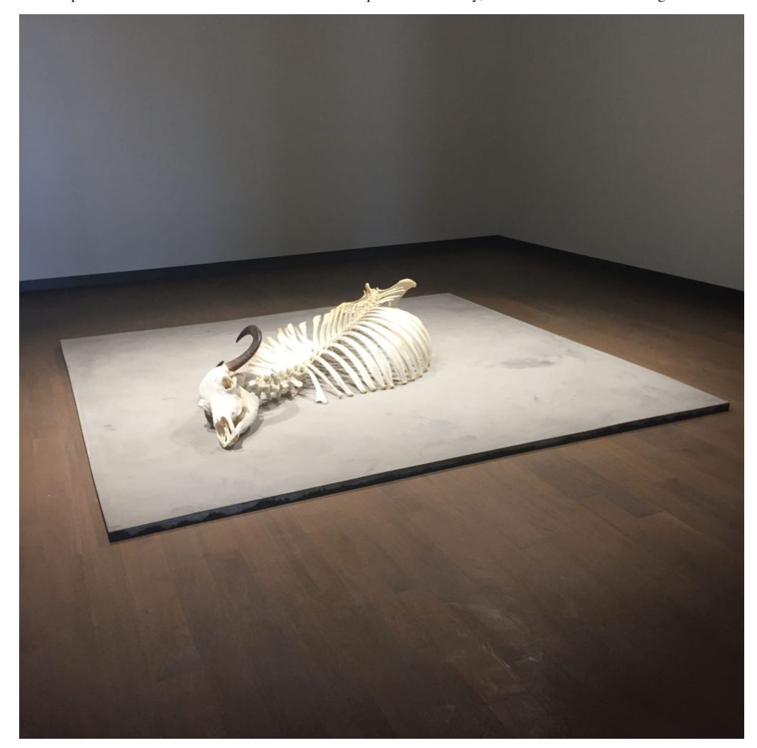
Ozan Atalan's work Monochrome in the Istanbul Biennial.